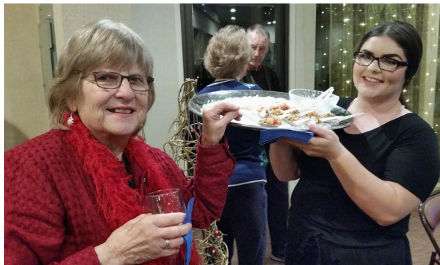
Our wonderful caterers