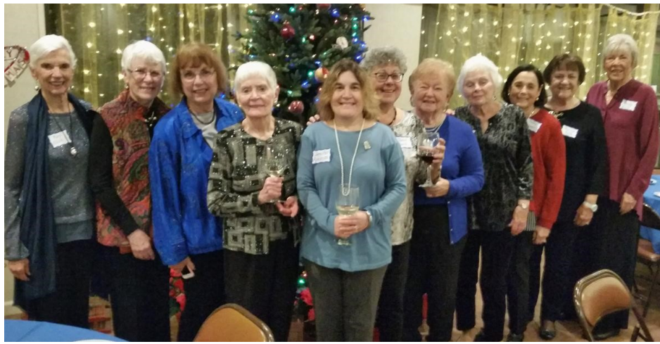
The Planning Committee