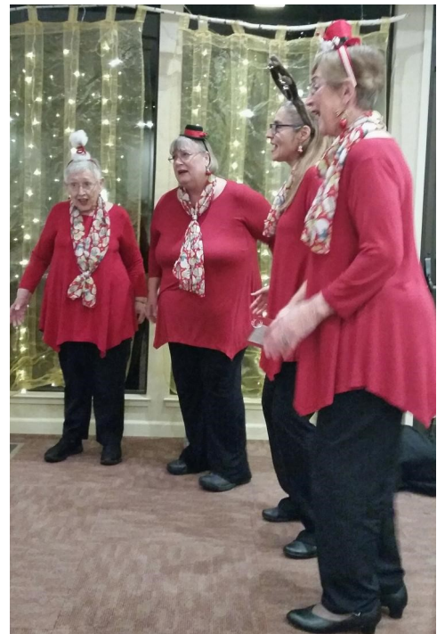
Any Wednesday Quartet